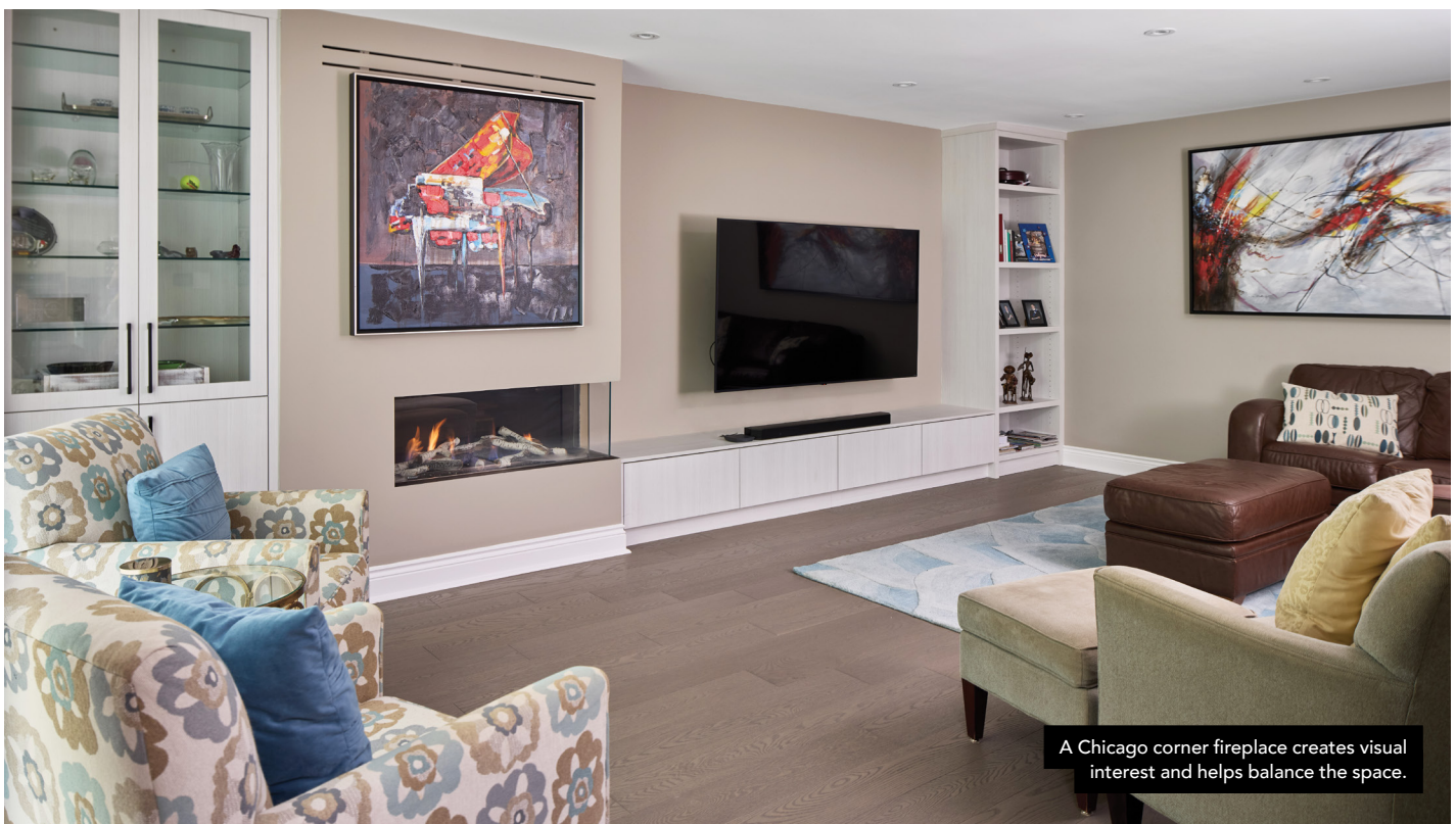
A Chicago corner fireplace creates visual interest and helps balance the space.